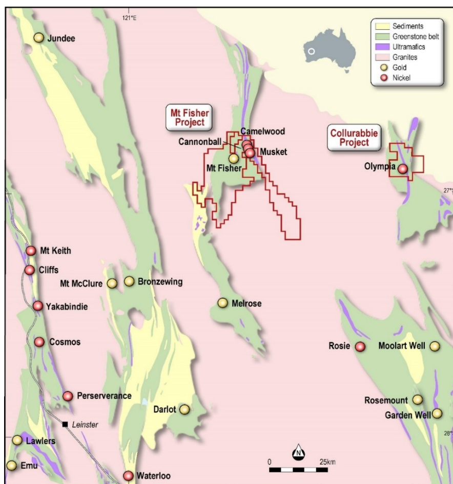
Figure 1: Rox Project Location Map